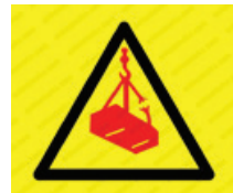
DO NOT USE UNDER LOAD