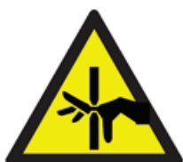
HAND JAMMING HAZARD

** This section provides safety instructions that must be followed when transporting, installing, operating the machine, performing maintenance and scrapping.